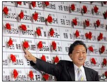
DPJ leader Yukio Hatoyama says he is

The election defeat of Japan's Liberal Democratic Party (LDP) after 54 years of nearly unbroken rule and the landslide victory of the opposition Democratic Party of Japan (DPJ) has met a cautious welcome in newspapers around in the world.