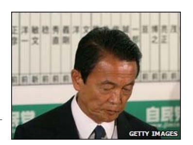
Taro Aso said the results were "very

Officials said the turnout held up despite a combination of typhoontriggered rainfall around Tokyo and a government warning that a swine flu epidemic was under